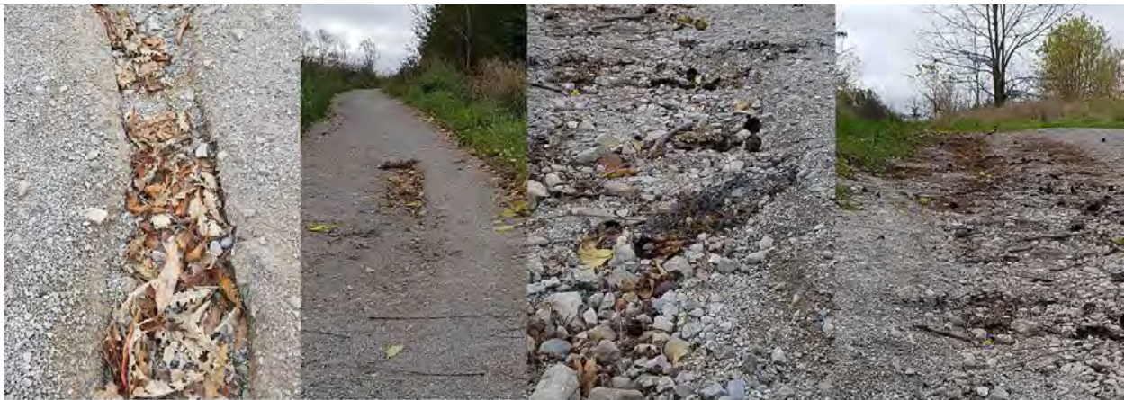
From left to right above, m9_100m_w3, m9_500m_East, Yonge_w7, Yonge_w8.

100m west of Marker 9. See photos M9_100m_W1 thru W3