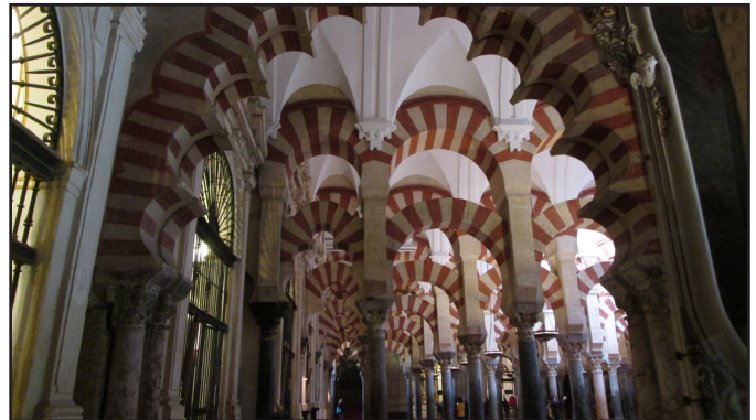
top: The Alhambra