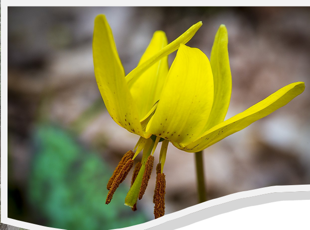
Trout Lily and Trilliums.